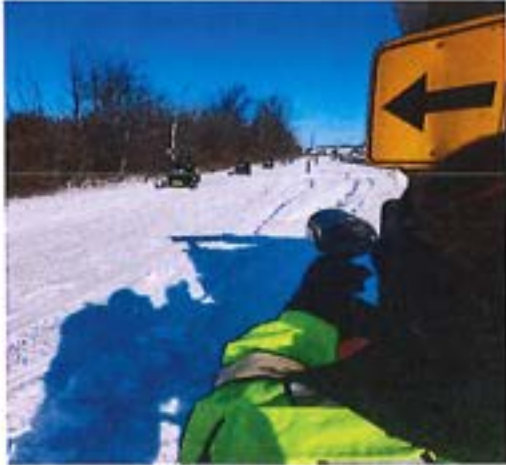
Snowmobile Trail Safety