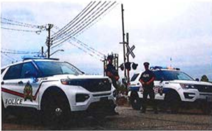
Railway Safety Week