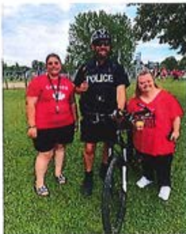
Canada Day Celebrations